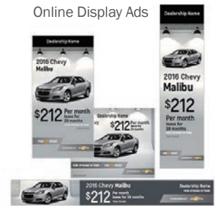
Online Display Ads